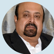
VICE CHANCELLOR HIDAYATULLAH NATIONAL LAW UNIVERSITY