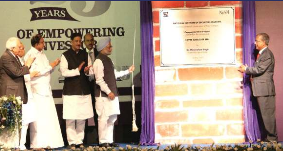
Commemorative plaque of commencement of construction of NISM campus by Dr. Manmohan Singh , Former Prime Minister of India.