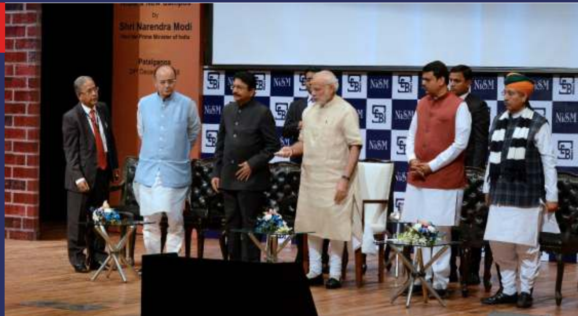
Inauguration of NISM's state-of-the-art Campus at Patalganga by Shri. Narendra Modi , Hon'ble Prime Minister of India.